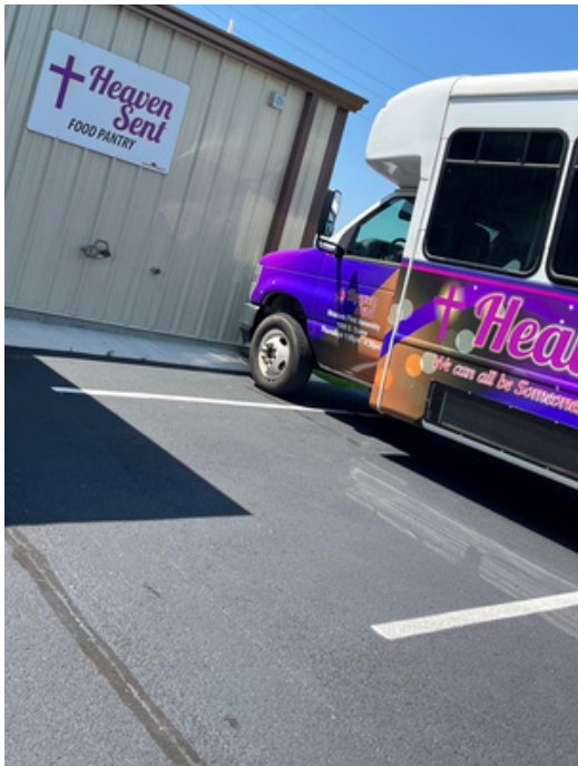
LOCAL FOOD DISTRIBUTION

At Clean Food Initiatives, our commitment to giving back is at the heart of our mission. Presently, we're actively engaged in making a difference through our produce donations to local food distribution efforts. By providing fresh and nutritious produce, we're contributing to the well-being of our community members in need. But that's not all—we're excited to announce our upcoming school program launch. This initiative will empower children with essential knowledge about sustainable farming and the journey of food, fostering a deeper connection to healthy eating and responsible practices. As we continue to donate and educate, we're proud to be a driving force for positive change in both our local community and the lives of young learners.