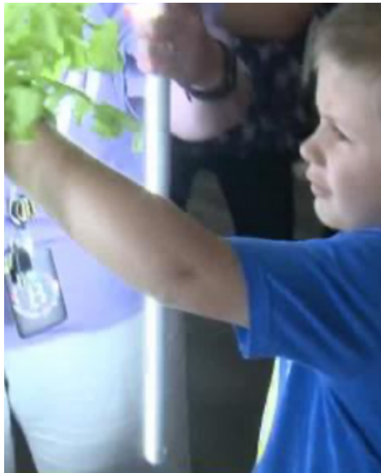
SCHOOL MOBILE POD

Clean Food Initiatives is currently giving "better than organic produce" to a local food distribution center in Skiatook, Oklahoma.